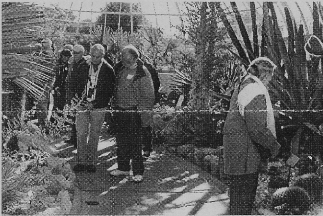
Members and guests in the Conservatory

to the Bronx where they were taken on a guided tour to see some spectacular Japanese plants (bonsai, maples and chrysanthemums), desert plants and The Holiday Train Show, a marvelous display in the Conservatory. There, as many as 11 large gauge trains zipped along a route past over 100 well known New York City landmark buildings and over bridges made from botanical and natural materials such as leaves, twigs, bark, berries and cones. Some of our members even ventured outside to take the 40 minute narrated tram ride through the grounds. A visit to the Garden Shop topped off a unique day at the Garden. The pictures on the first page and below show part of the good time had by all.