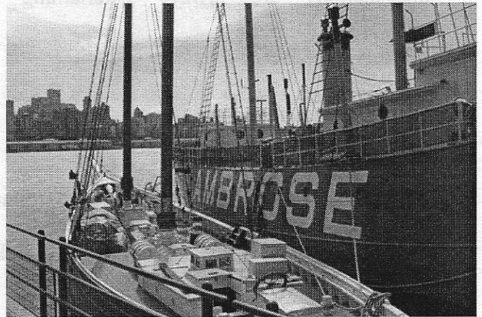
South Street Seaport