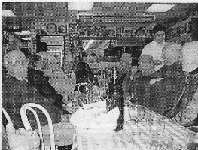
Enjoying lunch at La Mela Restaurant

The ensuing walk through the Lower East Side (Alfred E. Smith Memorial Park), Chatham Square (the location of the Gay 90's saloons, cabarets, and renown period entertainment area) led us through Chinatown and to the La Mela (The Apple) Restaurant on Mulberry Street in Little Italy for an extended lunch, and a gelato at Ferraro's on Grand Street.