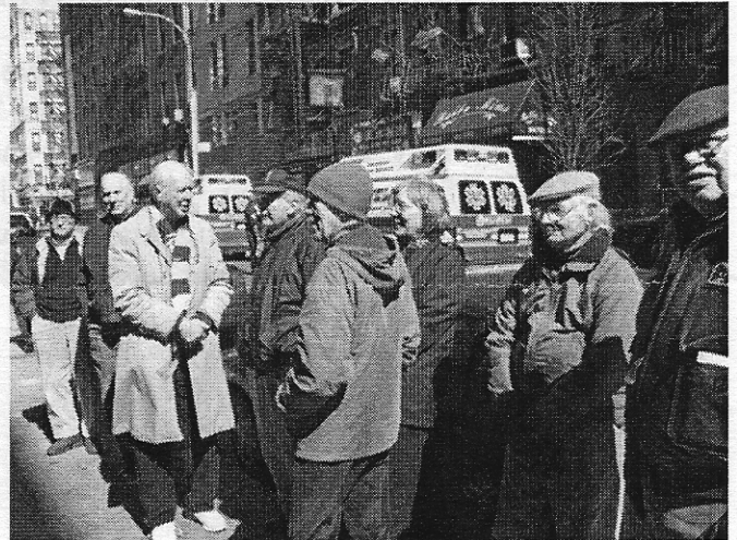
Our Wandering Seniors

They then walked the streets of Dutch New Amsterdam, Colonial New York, South Street Seaport, the now gone Fulton Fish Market, and wound up in the oldest drinking establishment in New York City, The Bridge Café, located in a 1794 building located at the corner of Water and Dover Streets, for a refreshment and rest break.