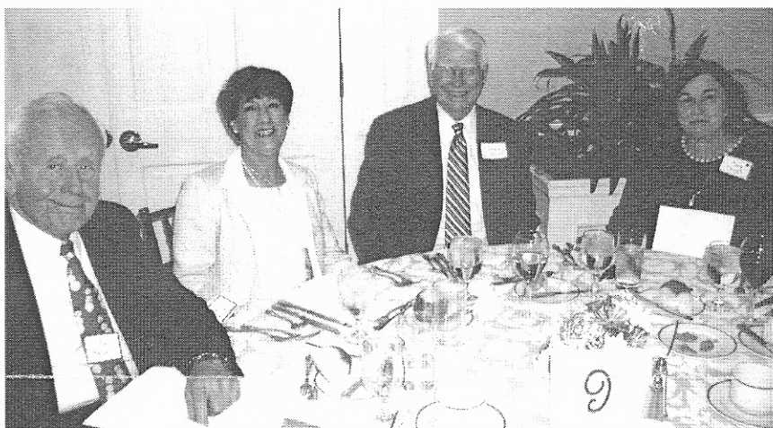
Happy Leaders and Wives at Christmas Party

MERRY CHRISTMAS AND A HAPPY NEW YEAR TO ALL