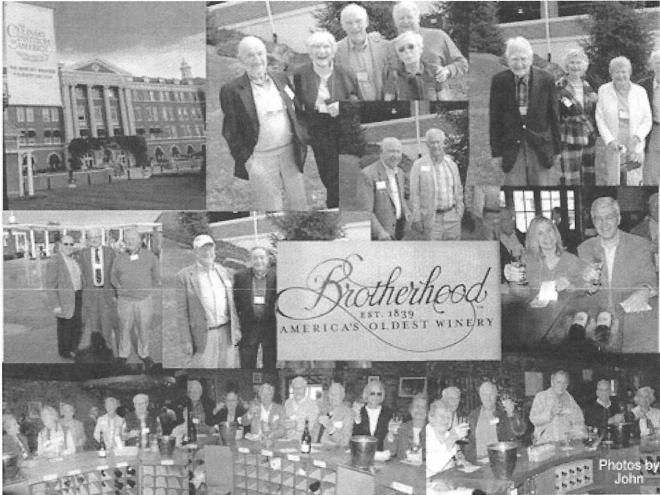
Culinary Institute and Brotherhood Fans