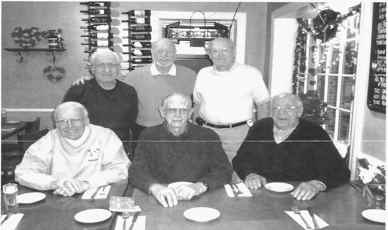
ROMEO, Retired old men eating out