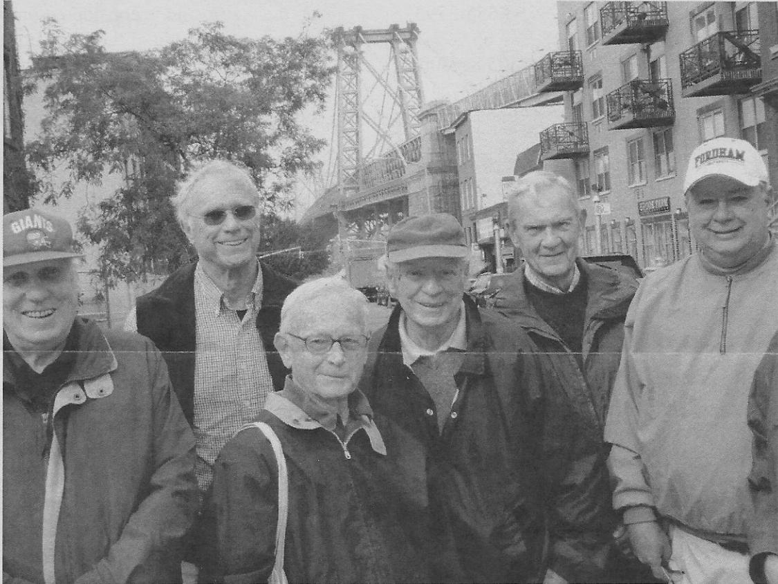
Happy Wanderers at Their Williamsburg Bridge walk to Queens