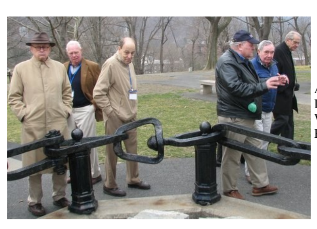
A cold Day at West Point