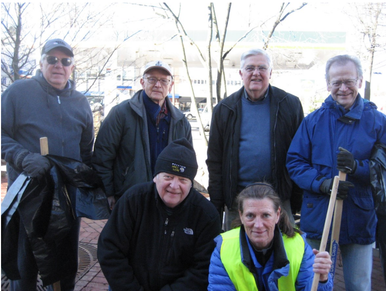
Town Cleanup , April 25, 2015