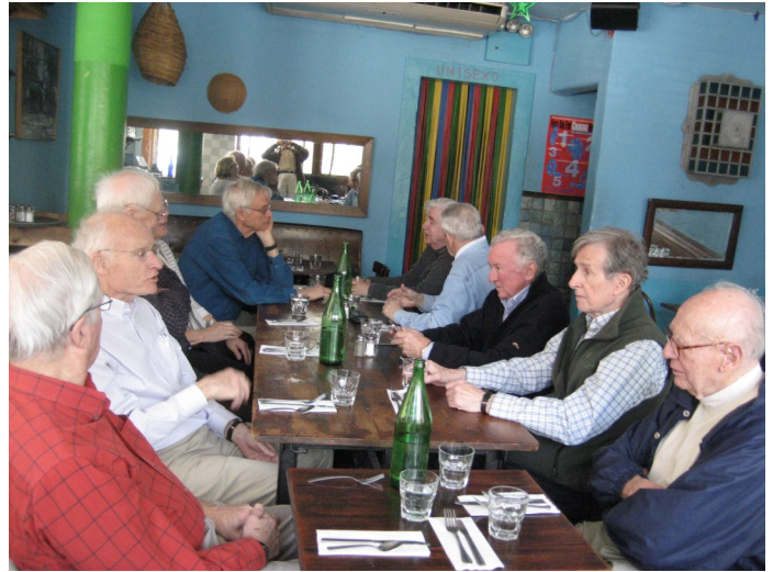
Wanderers relaxing in Alphabet City