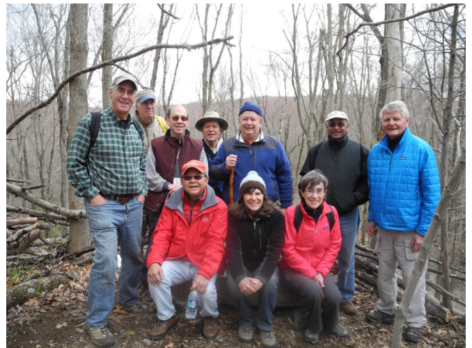
Zofnass Family Preserve Hike April 23,