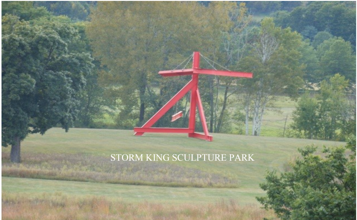
STORM KING SCULPTURE PARK